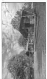
Woody Plus Safert Tents