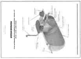
Klargester BioEfficient 6 Treatment Plant